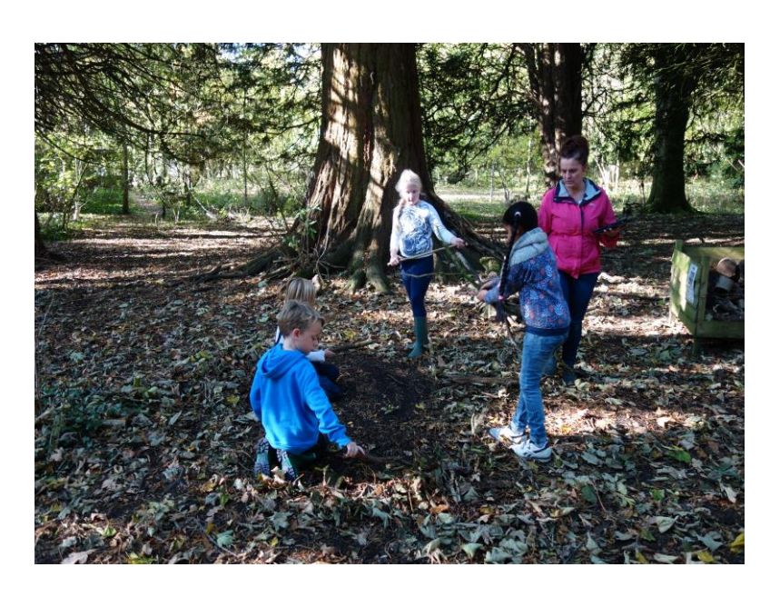
Children enjoying making pyramids with stick and twigs