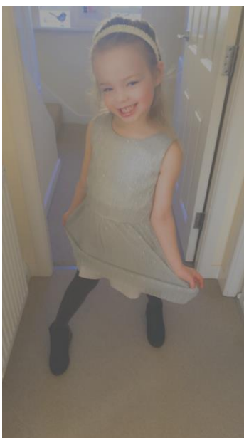
Scarlett all dressed up in party clothes.