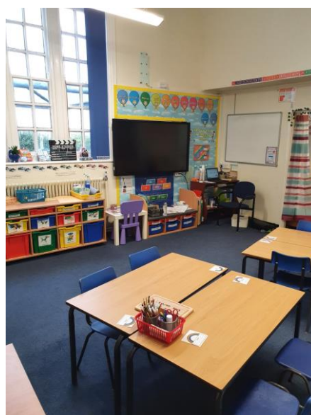
The dedicated Year 1's area in the Reception classroom.