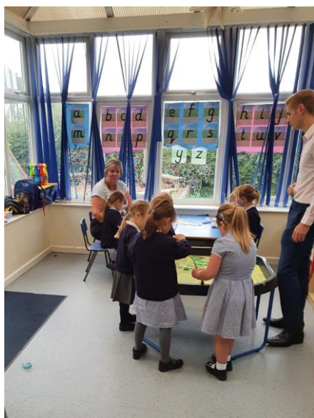
Some of the Reception children