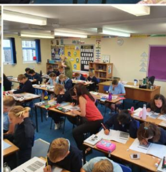
Years 1-6 in their classrooms.