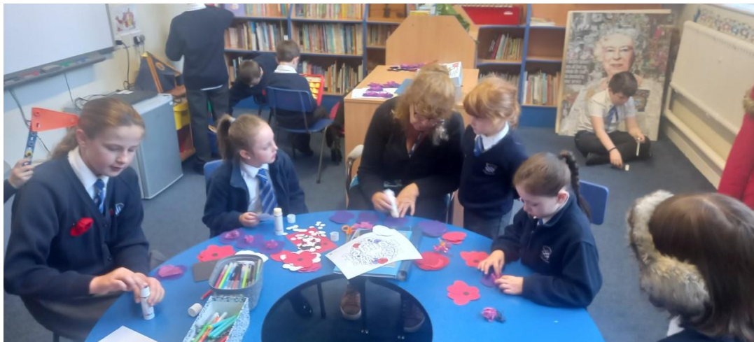
The children in Breakfast Club making poppies for the special display in the hall.

The School Choir will be representing Buckminster School at the Sewstern Memorial Service on Sunday at 10.45am. All are welcome to join us. There are refreshments available following the service at Sewstern Village Hall.