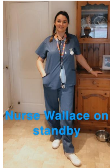
We were in safe hands today...!